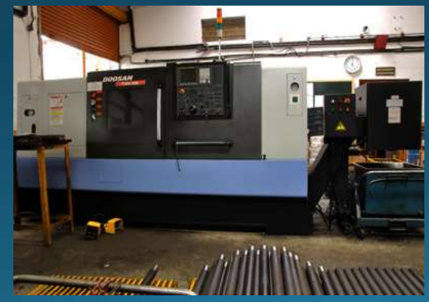
Doosan CNC Turning