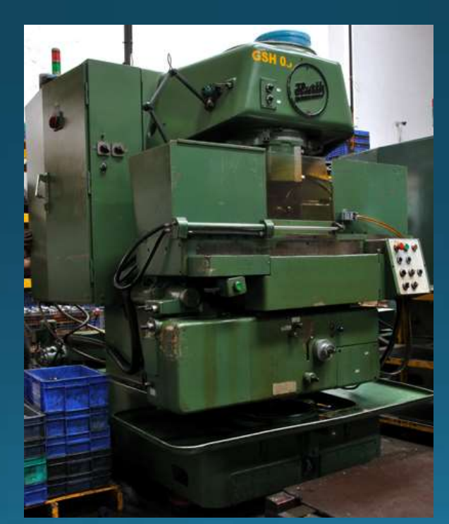
Gear Shaving M/C